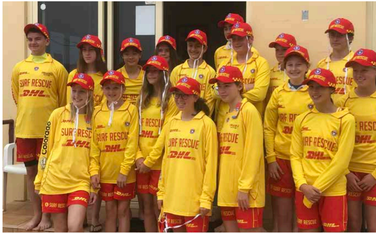
SRCs in Uniform

another lucky young group, so you will continue to see his smiling face for many more years.