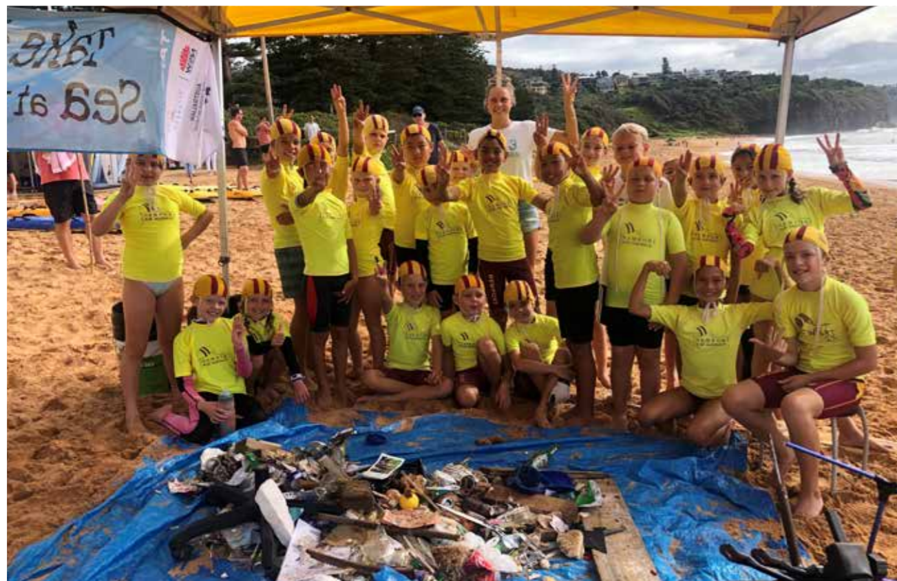
Take 3 for the Sea