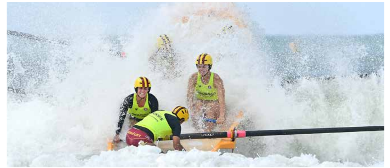
Open Female Crew - Thunder