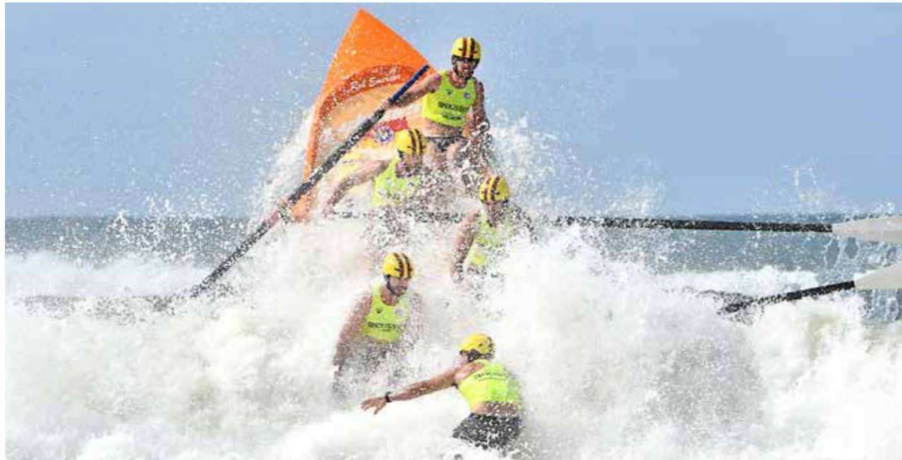
Open Male Crew