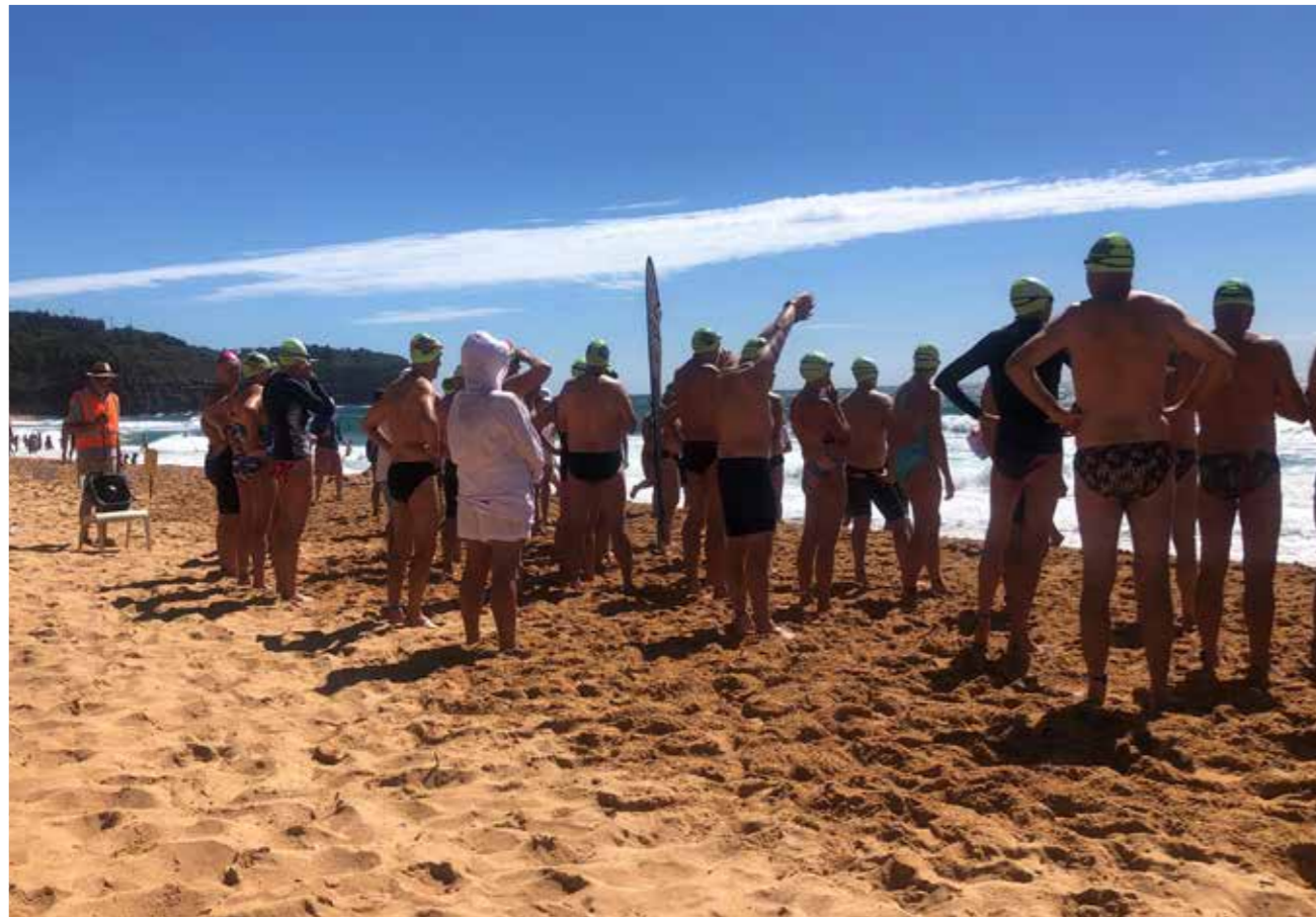
The long-awaited Pool 2 Peak made a grand return this season