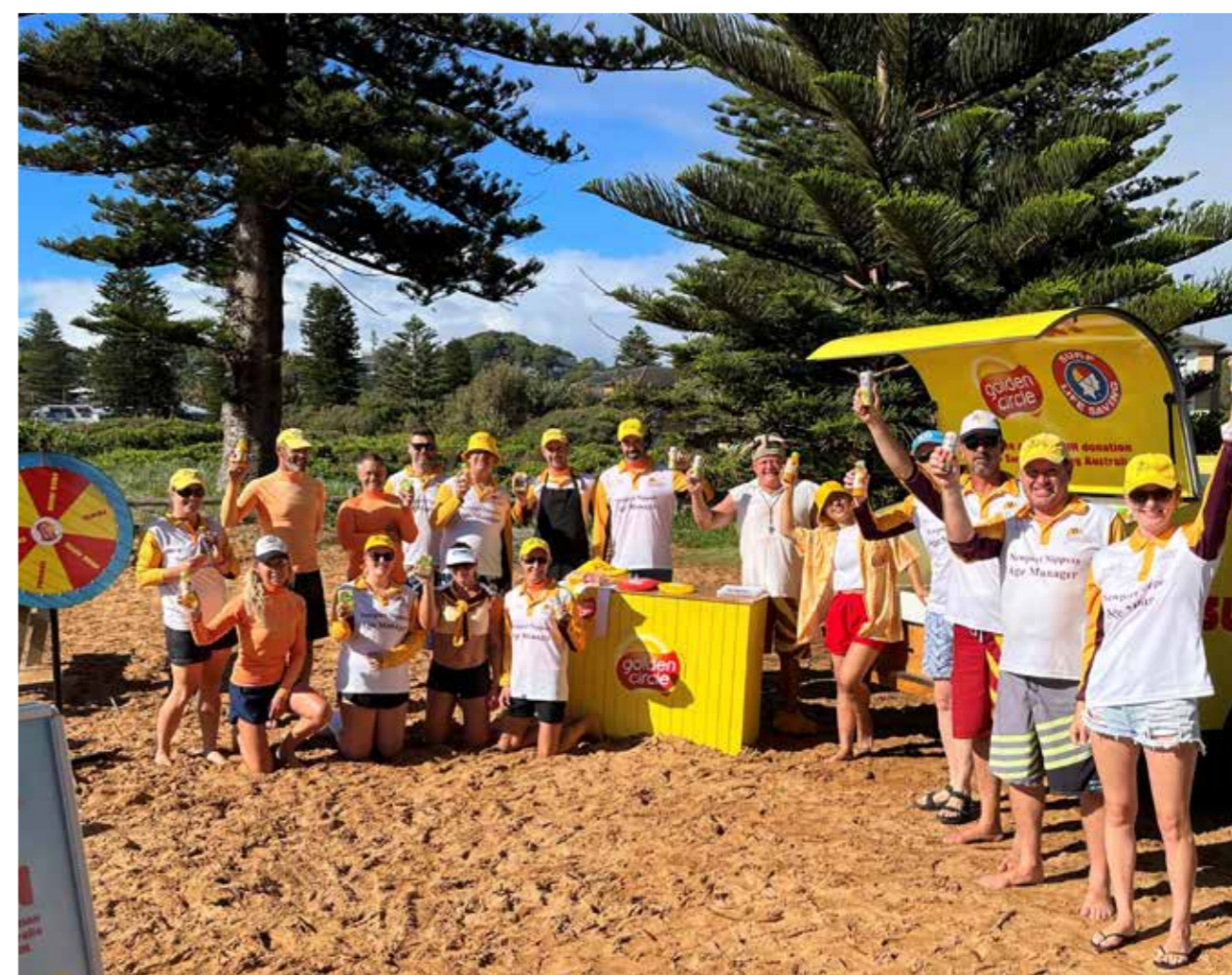
Age Managers at the Golden Circle Promotion