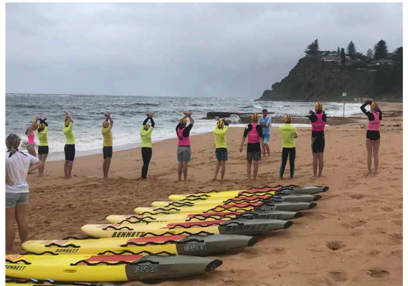
SRCs being tested on their signals knowledge