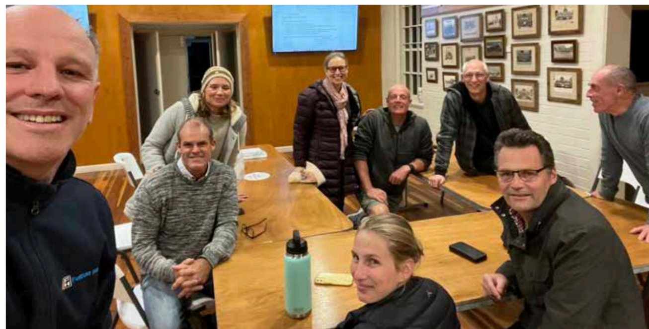
Final Management Committee Meeting on 11 July 2022