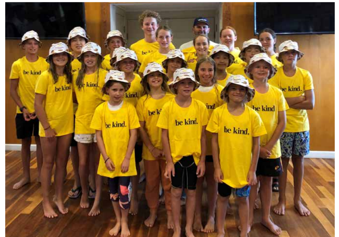
State Nipper Team

Unfortunately, the excitement of a local State Championships on the Northern Beaches was dampened by predictions of rain, wind and difficult surf conditions. The younger age groups (u9 – u12) competed on the Thursday/Friday, and the older age groups (u13 – u15) were due to compete on the Saturday/Sunday in a block racing style format. The weather and surf arrived on Day 1 as predicted, and the usual chaos of the State Championships was