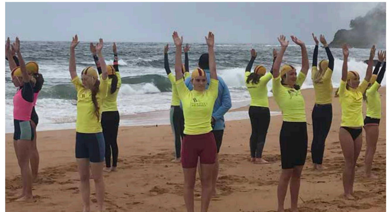
SRCs Signals Test