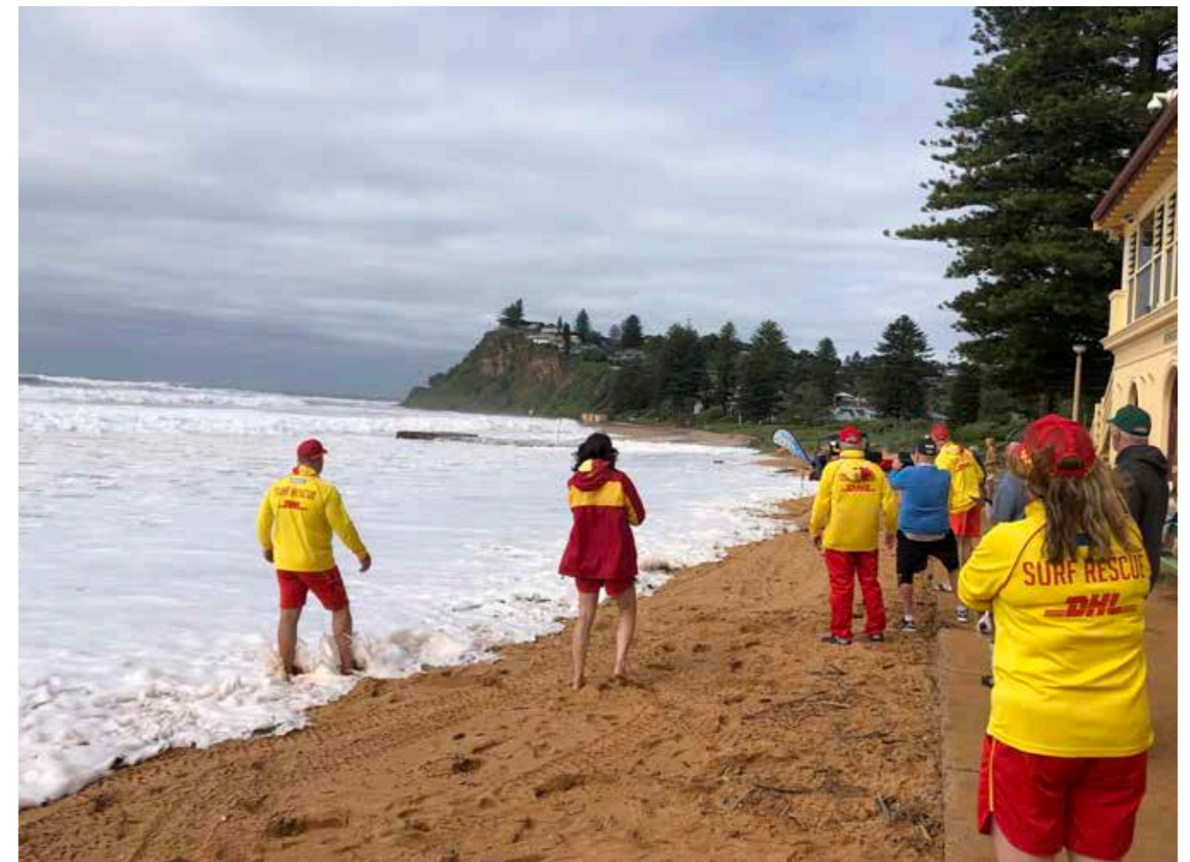
Patrol 8 on duty during a King Tide on 2 April 2022 at 10:46 am